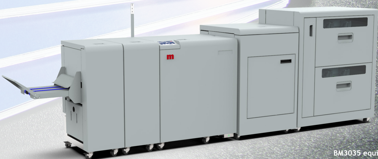
BM3035 equipped with CST unit and VFX Feeder

The optional CST (Crease and side trimmer) unit enables you to produce professional, full bleed trimmed and creased booklets in a cost effective, compact module. Combine this with our unique signature SquareFold system to create a square-back to any document, booklet or publication, giving the effect of a perfect bound book. This finish makes them much easier to handle, stack and pack!