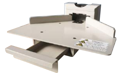
Round corner unit