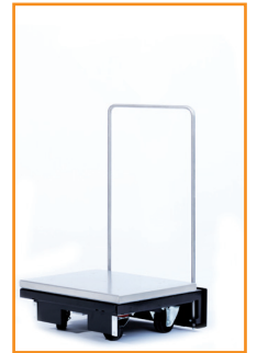
■ Kodak Digimaster High Capacity Stackers