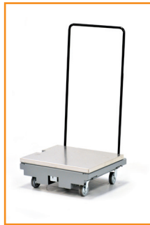
■ HP Indigo Cart / Pallet 3500, 5000 and 7000 series