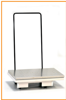
■ Xerox iGen 150 (26")

■ Positioned as the optimal alternative to In-Line finishing, the BSF is a high volume sheet feeder designed to match today's market demands. Coupled with the capability of using trollies/carts/pallets from your printer, stacks of pre-collated documents – whether from digital color, digital monochrome, or from offset presses – can easily be fed into post-printing equipment.