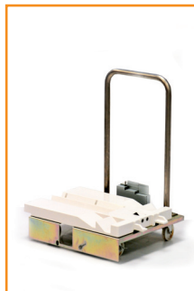
■ Xerox ColorPress 800/1000