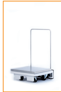
■ Xerox DocuTech & Nuvera DS5000 and DS3500 stackers