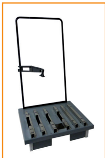
■ Océ Varioprint 6000 series