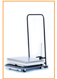
■ Xerox iGen 3, 4 (20.5")