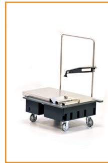
■ Xerox DocuColor DC 5xxx/6xxx/7xxx/8xxx