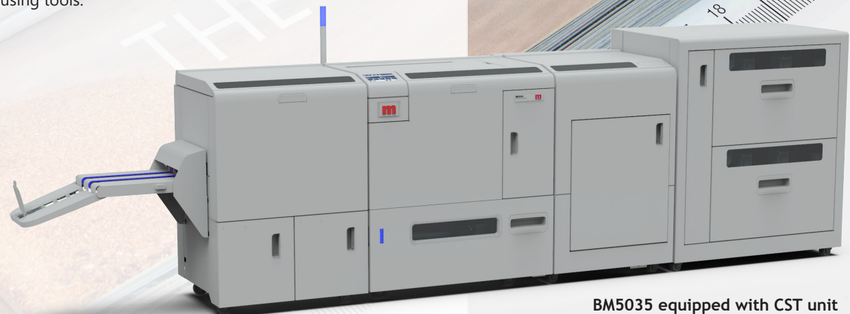
BM5035 equipped with CST unit and VFX Feeder

Stitching: The BM5035S or BM5050S stitch from wire spools. Each spool contains approx 50,000 stitches depending on the thickness of the book. The leg length of the stitch can easily be adjusted from job to job without using tools.